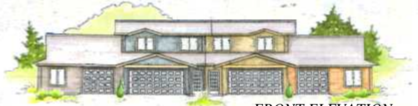
Left Mid Unit FRONT ELEVATION