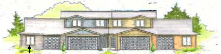
Left End Unit